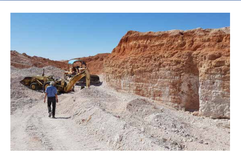
"Ray's Opal Mining Patch"

UNET JOSS is an innovative, multidisciplinary, open access, rapid-peer-review journal covering all aspects of science and society including education. The journal's wide-interest original papers, that are ensured to be of the highest academic quality, are typically ground-breaking or seen as having significant impact on current research trends and boarders.